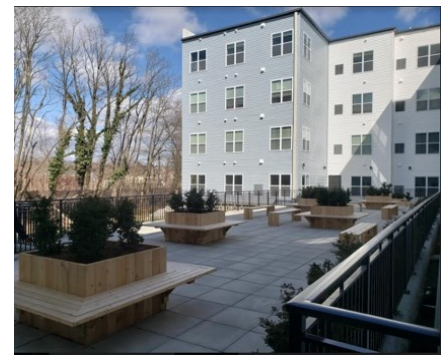
The Station at Grant

On Plainfield's South Avenue. The Centurion Plainfield is one of a few ongoing projects, and nearby, a Wawa will be completed by Thanksgiving.